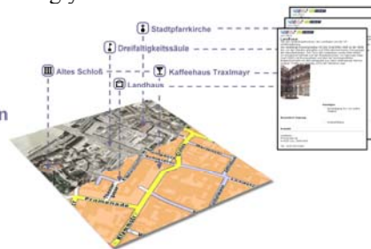
Fig 2b. Inclusion of External Web

Refresh of maps. The displayed map is refreshed automatically either as soon as the user performs an explicit action, e.g. panning the map or periodically to reflect the movement of the user. The refreshing period can be adjusted to the user's speed.