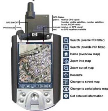
Fig 1. User Functionality

Search of POIs. The user is able to search POIs by indicating a thematic layer and a certain distance as search radius. Based on this information and the current user's position, POIs are filtered and displayed accordingly.