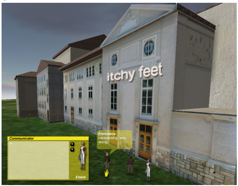
Fig. 3. The entrance to the premises of ``itchy feet".

with the human during her or his travel - even at a time the human is not actively participating. It remains proactive and collects potentially useful information based on the participant's profile. The agent provides tips and pointers to, e.g., local events in the travel region.