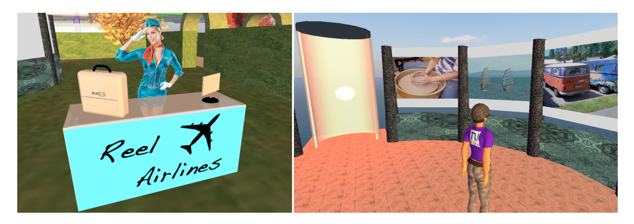
Figure 4: The avatar takes a suitcase and chooses one photo on every platform

To provide the possibility for her to be more closely involved the research project, we integrated feedback mailboxes into the Demonstration Area. She can send suggestions, ideas or points of critique to every exhibit. We implemented a reward system to reimburse her expenses. Users that contribute valuable comments or suggestions get an invitation to a special group. The membership to this group allows the hobby scientist to display the virtual degree "Dr.scien.virt.jun." above the avatar's name. This step is an incentive to explore the exhibits.