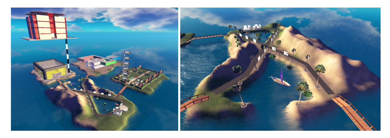
Figure 2: REEL and the Welcome Area