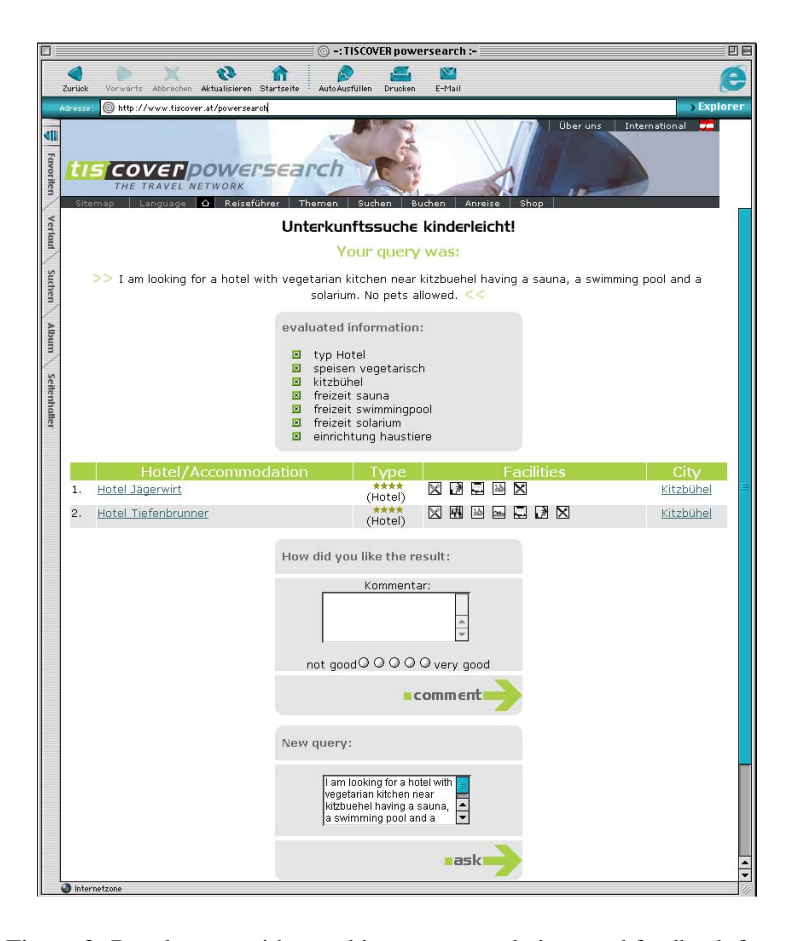
Figure 3: Result page with matching accommodations and feedback form