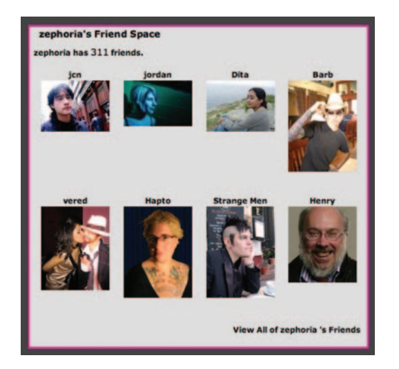
Figure 3 Example Top 8.

While teens will typically add friends and acquaintances as Friends, they will also add people because it would be socially awkward to say no to them, because they make the individual look cool, or simply because it would be interesting to read their bulletin posts. Because Friends are displayed on an individual's profile, they provide meaningful information about that person; in other words, "You are who you know."<sup>41</sup> For better or worse, people judge others based on their associations: group identities form around and are reinforced by the collective tastes and attitudes of those who identify with the group. Online, this cue is quite helpful in enabling people to find their bearings (see Figure 3).